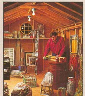
MOVING & STORAGE